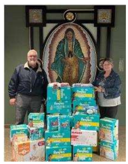
continued on page 4

Pregnancy Servicxes of Delta County 2501 1st Avenue North Escanaba, MI 49829